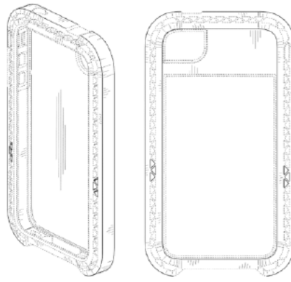
Fig. 1 (front) and Fig. 3 (back)